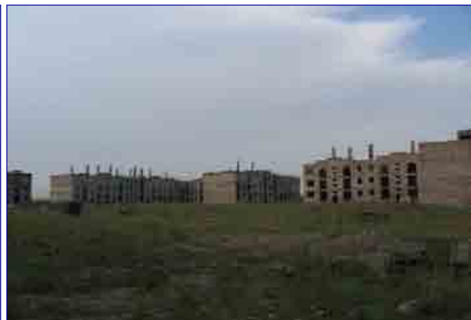
"ghost city", 2005